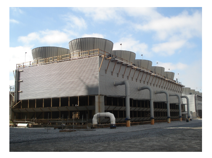
Field-erected (FEP) cooling tower — induced-draft counterflow cooling tower