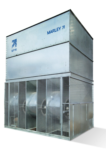
Forced-draft cooling tower – factory-assembled (FAP) counterflow cooling tower