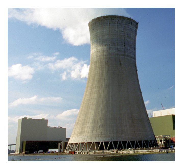
Natural-draft cooling tower — field-erected (FEP) counterflow cooling tower